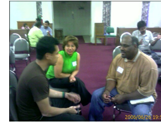
NC Latino Coalition