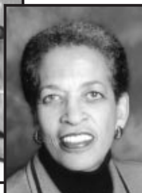
Dr. Johnnetta B. Cole