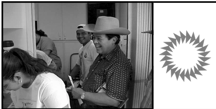
Latinos United of Carrollton County Fall 2002 Grantee