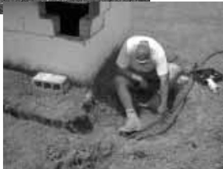
Right: The West End Revitalization Project, Fall 2002 Grantee