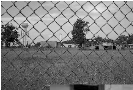
Left: An underground leak from a local company contaminated the ground water in a neighborhood