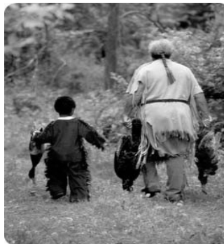
Above: Occaneechi Band of Saponi Nation

To combine organizing with legal strategy and work to repeal a law that prohibits collective bargaining for public sector workers.