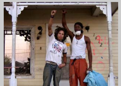
In New Orleans, LA, the People’s Organizing Project’s motto is: “Nothing Without Us is for Us”

Congratulations to FSC’s 2006 Torchbearer Award