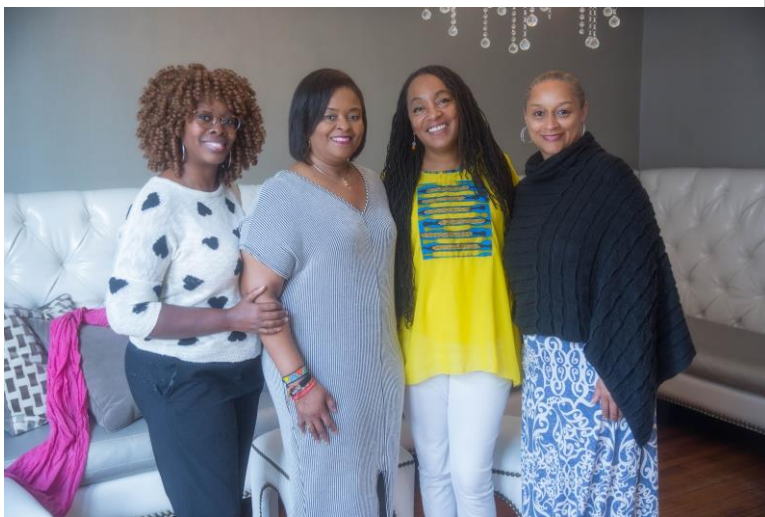
Southern Black Girls Funding Initiative

The Southern Black Girls and Women's Consortium has partnered with the NoVo Foundation to support the growing movement for Black girls in the Southeastern U.S. A new collective of funders, activists, and community leaders is working to advance the movements for Black girls and women in the Southeast. The fund for Southern Communities will be in collaboration with the Appalachian Community Fund , Black Belt Community Foundation , and Truth Speaks Consulting to birth the Southern Black Girls and Women's Consortium.